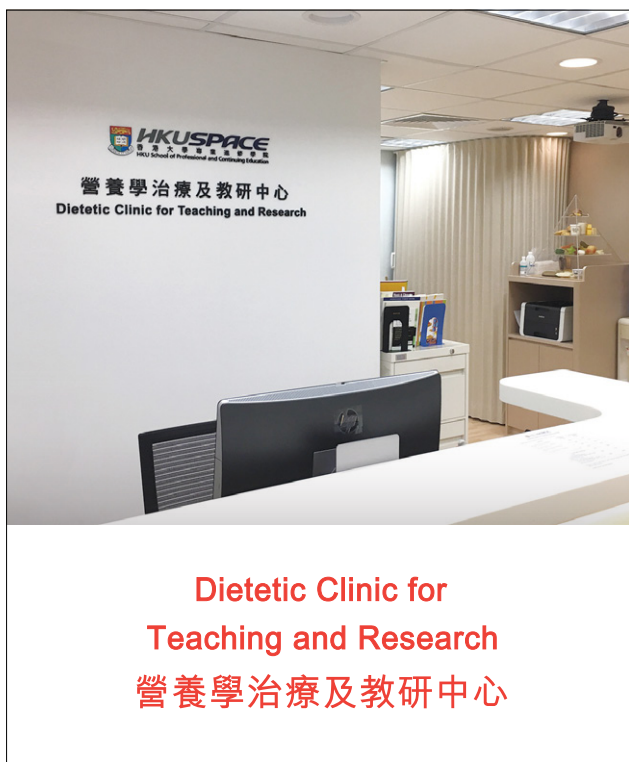
Dietetic Clinic for Teaching and Research 營養學治療及教研中心